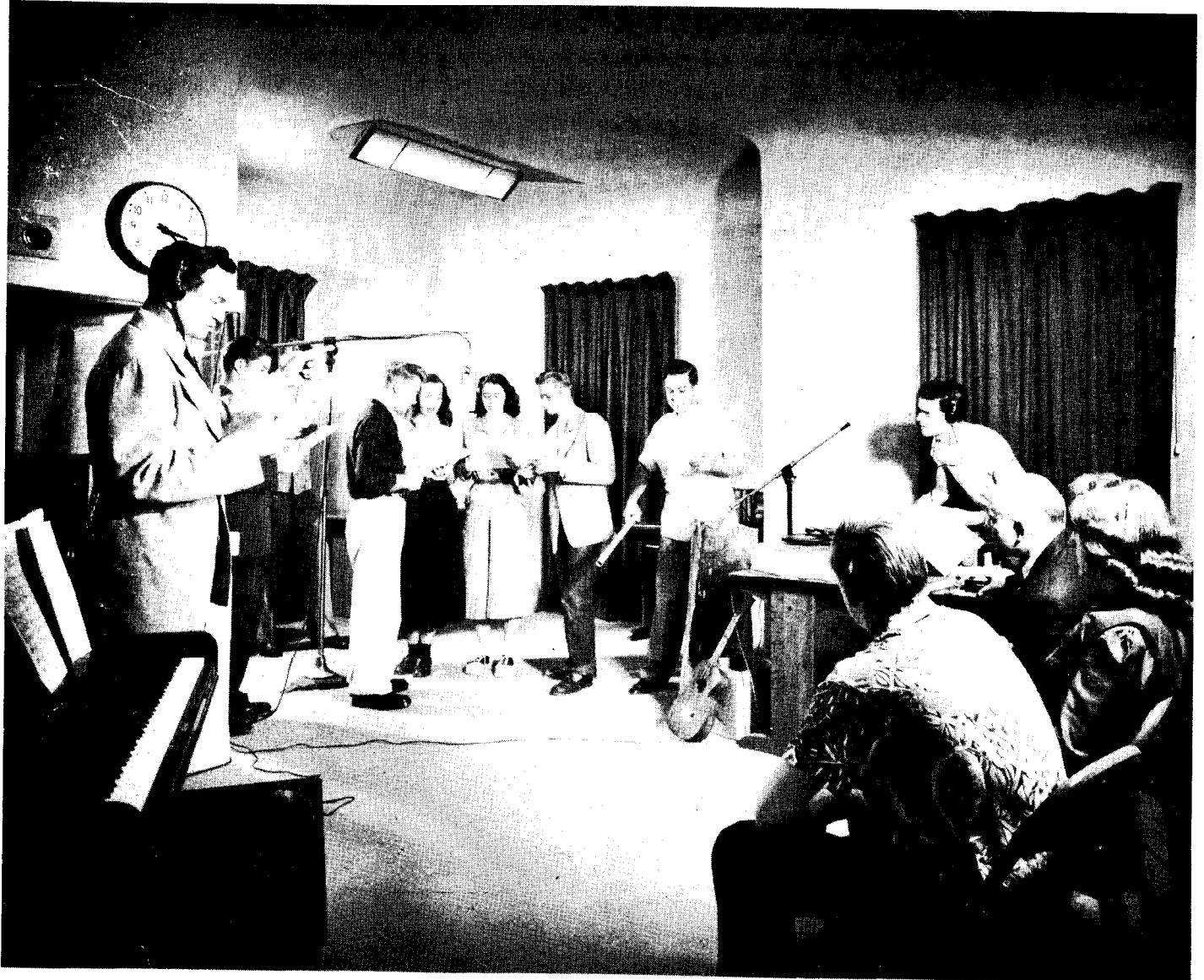
Broadcast Studio: Radio Drama being recorded.

the campus during the next five years. These plans contemplate erection of three new buildings and other changes, improvements and additions, which will provide Ambassador College with a truly fine and thoroughly adequate plant in every respect. Work is now proceeding on clearing and developing the new athletic field, adjoining the campus across Terrace Drive, to the east. We expect to have this in operation for softball by spring. The growth and development of Ambassador College during its four and a half short years is nothing short of miraculous.