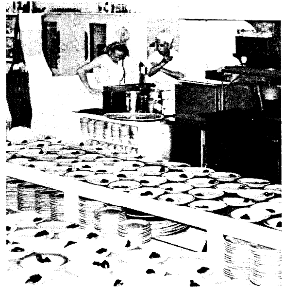
Dozens of plates are being filled with healthful foods. They were then carried on trays by the servers and placed on the dining tables.