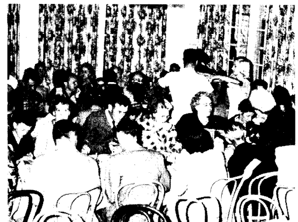
The dining room. Combined with the wonderful spiritual feast was this material feast—one of God's many bounteous blessings for which we were all thankful.