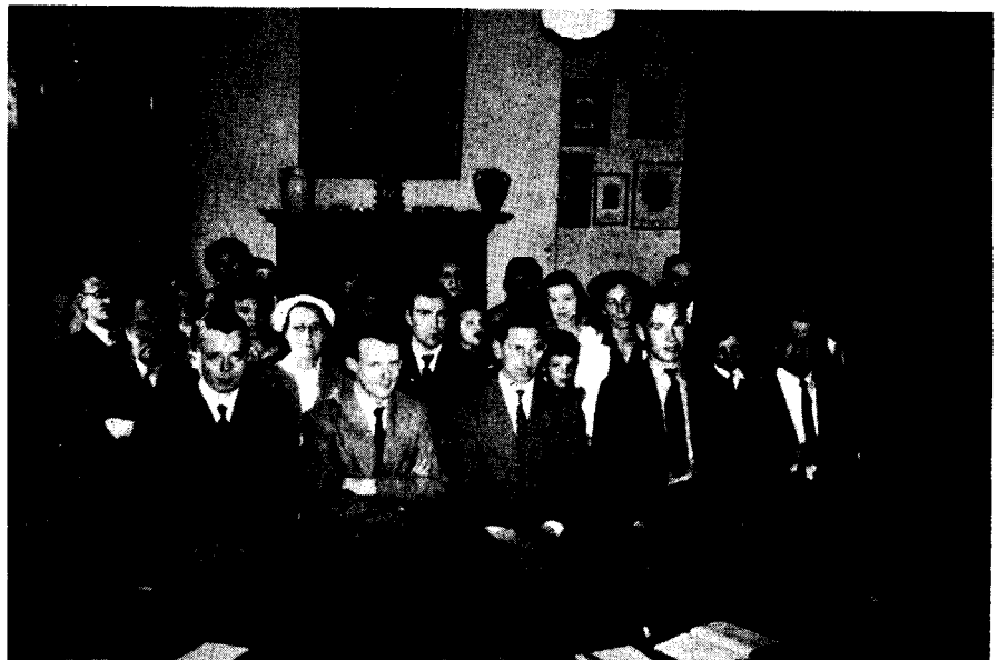
Here is a recent photo of our London church during services!

You should PRAY for these brethren (Please continue on page 11)