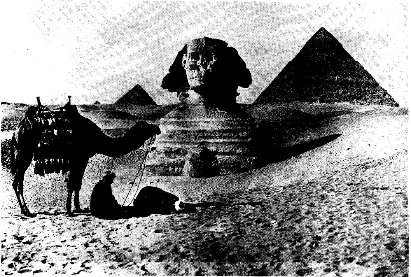
Arabs praying near the Great Sphinx before the sand was dug away from its base. The second largest pyramid is in the background to the right.

me men gave ear, and waited, and kept silence at my counsel. After my words they spake not again. . . . I . . . sat as chief, and dwelt as a KING in the army, as one that comforteth the mourners" (Job 29:21-25).