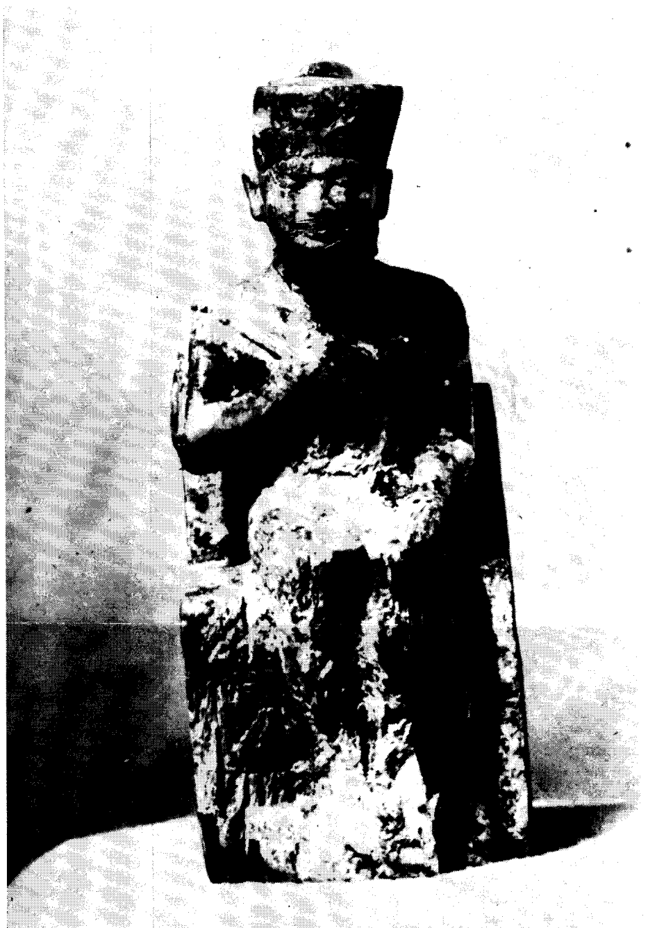
A badly damaged ivory statuette of Cheops from Abydos, Egypt. No other statues are known of him. The features of Cheops are distinctly non-Egyptian. Cheops built the great pyramid of Gizeh, near Cairo. It is the first and also the greatest pyramid ever built.

The Great Pyramid was built, according to Herodotus, over a period of about 20 years in the 3 months of each year during which the Nile overflowed and the people were idle. Its construc-