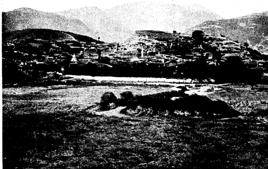
PHILADELPHIA as it is today. The ancient city in apostolic times became a type of this work today! Here is a modern view of Philadelphia, in Turkey, from the plain overlooking the city. Mt. Tmolus rises in the background.

Now let's notice what John wrote to the "Church at Sardis."