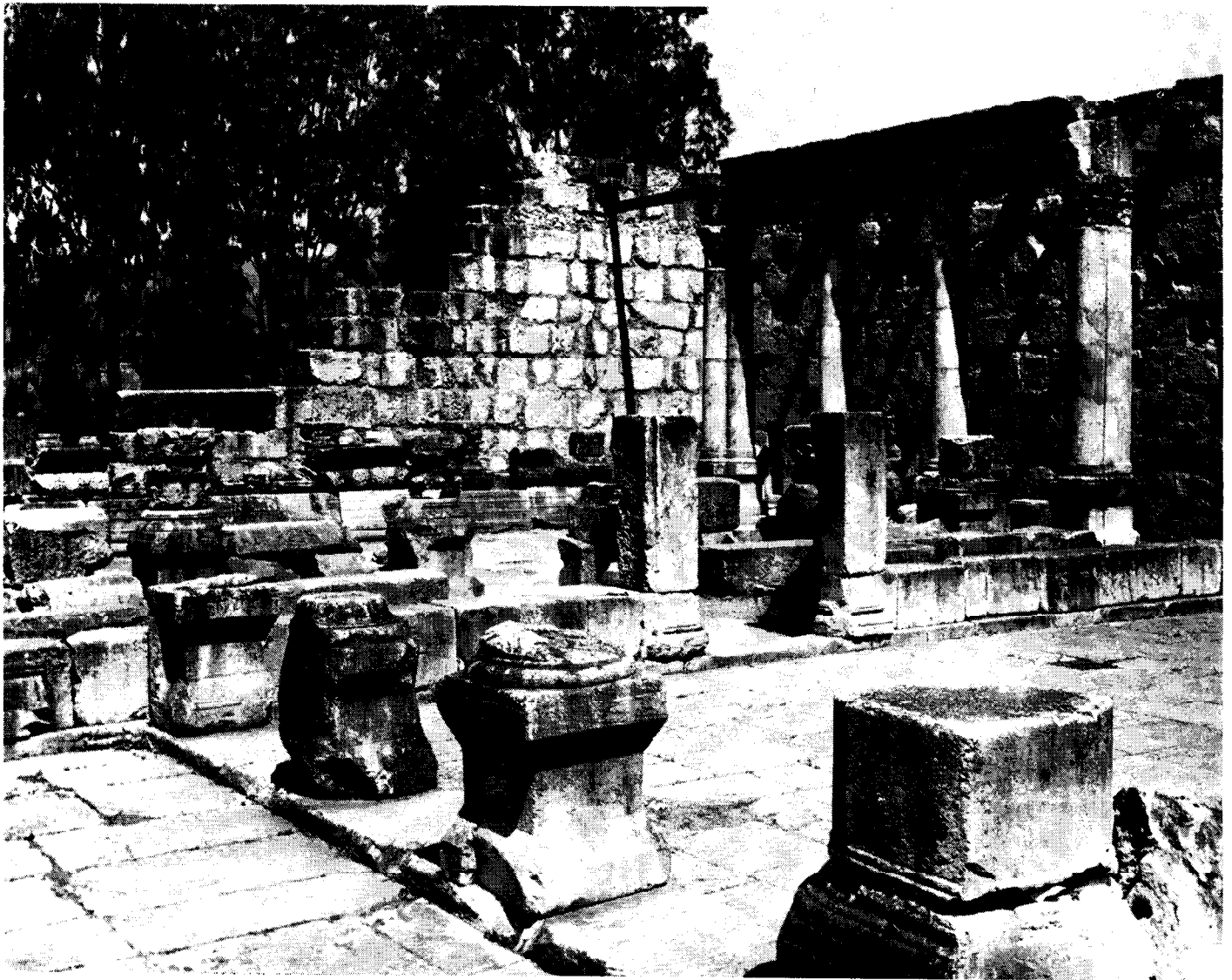
An inside view of the Capernaum synagogue. Though small, this was one of the largest synagogues in all Palestine.