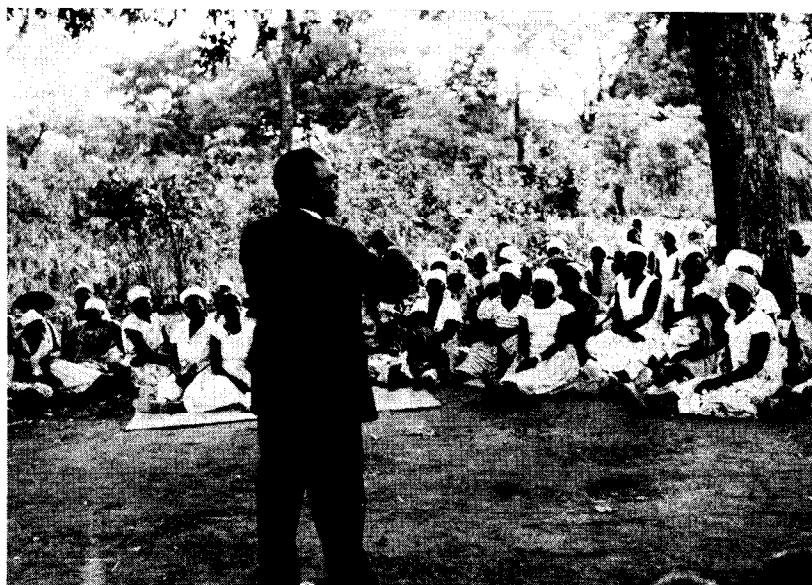
Service conducted at Kasenga's Village on May 7.