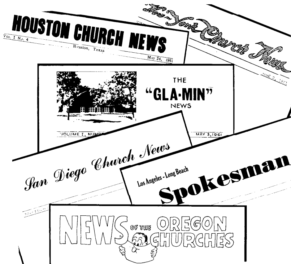
Mastheads of several of the local church papers.

The first newspaper on the stack is entitled "NEWS OF THE OREGON CHURCHES." You guessed it — it's partly illustrated by Mr. Basil Wolverton! Right under the headline is a little cartoon — drawn by Basil Wolverton — of a very interested reader with a newspaper in his hand, drawn so close to his face in profound interest that his nose has poked a hole through the paper! We find on the editorial staff of this Oregon