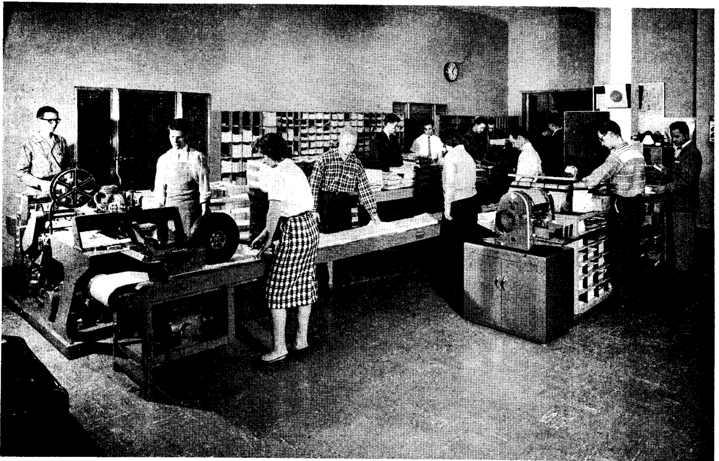
Ambassador College Press Mailing Department as it is today — 1961 — showing part of our new IBM electronic system.