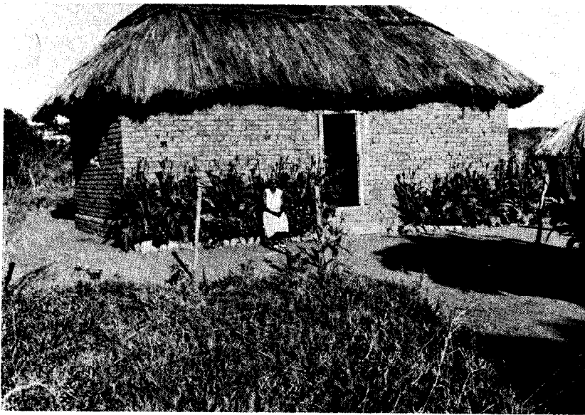
One of the teachers' houses at Mwambula's Village.