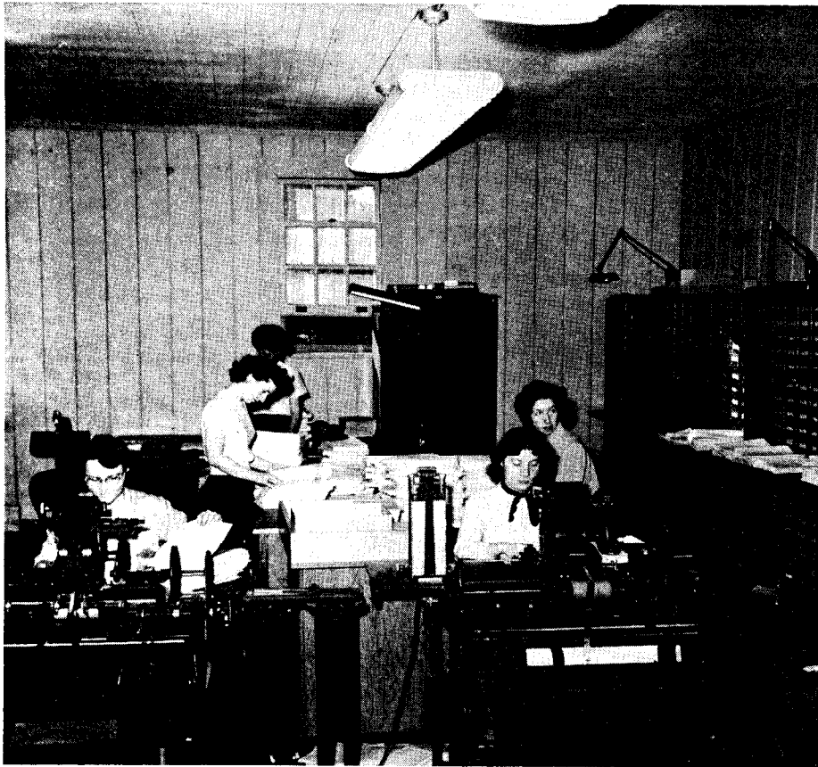
Ambassador College Press Mailing Department as it was in the years of 1948 through 1956.