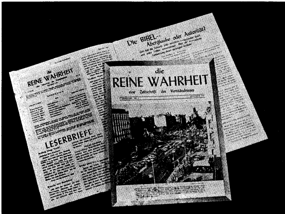
The September issue of Die REINE WAHRHEIT open to the lead article.