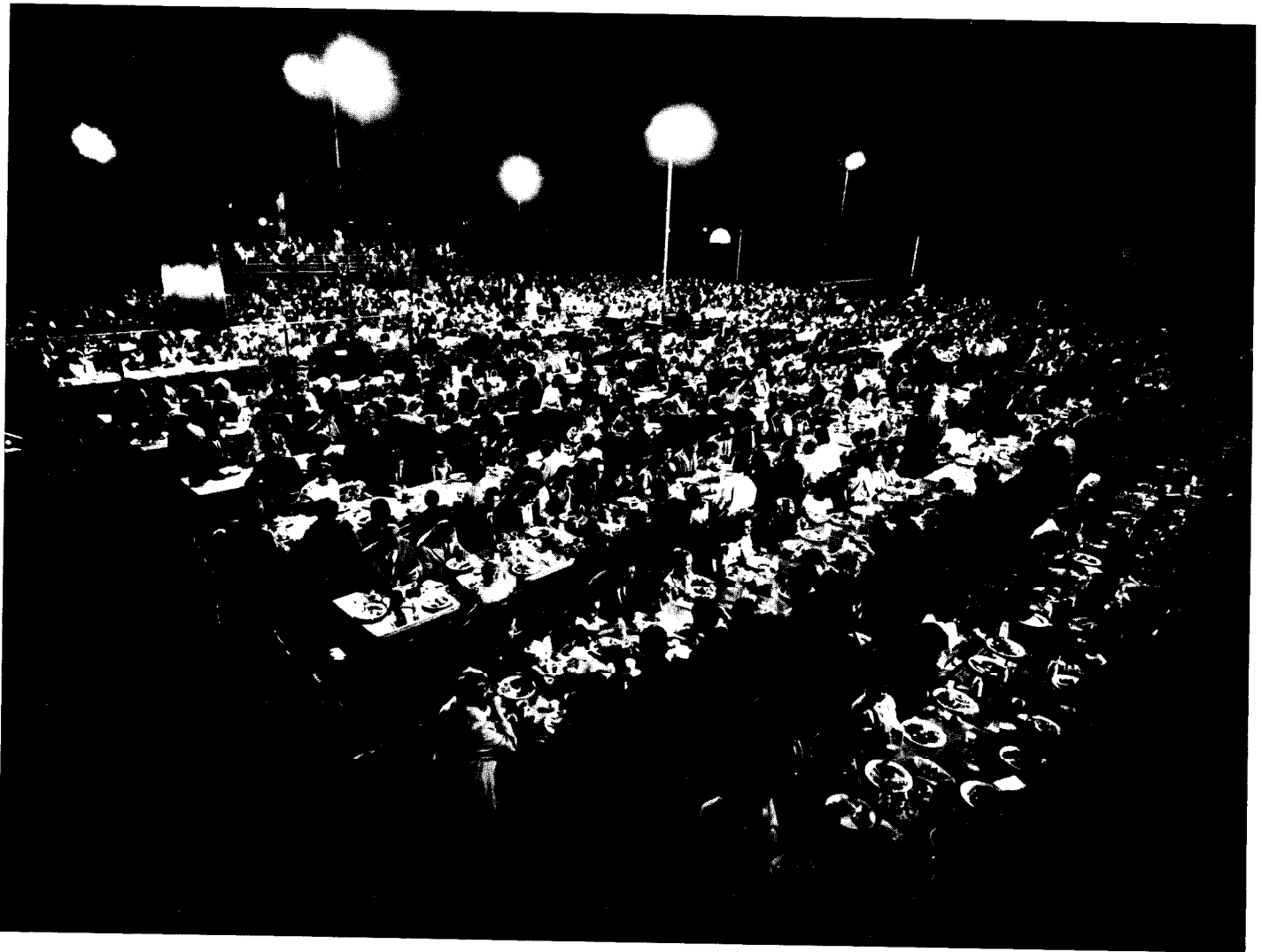
The delicious feast on the "Night to be Remembered" was enjoyed on the tennis courts of Ambassador College in Pasadena.

"We were blessed with splendid cooperation from all deacons, deaconesses,