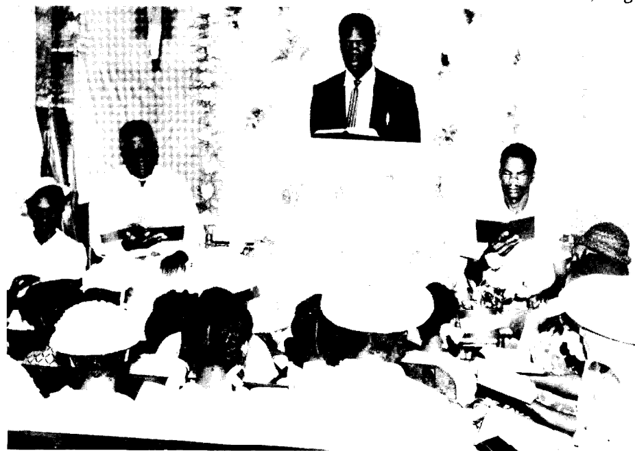
Notice the festive atmosphere in the Unleavened Bread service of our brethren in the West Indies.