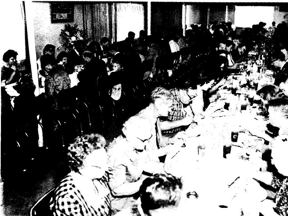
The brethren meeting in Opp enjoy one of their meals during the Feast.

"The National Guard Armory worked out splendidly. It was just like owning our own Tabernacle for the eight days. We had absolute privacy, use of the entire building, and were not disturbed by one intruder during the entire time. They say such is unusual in a commu-