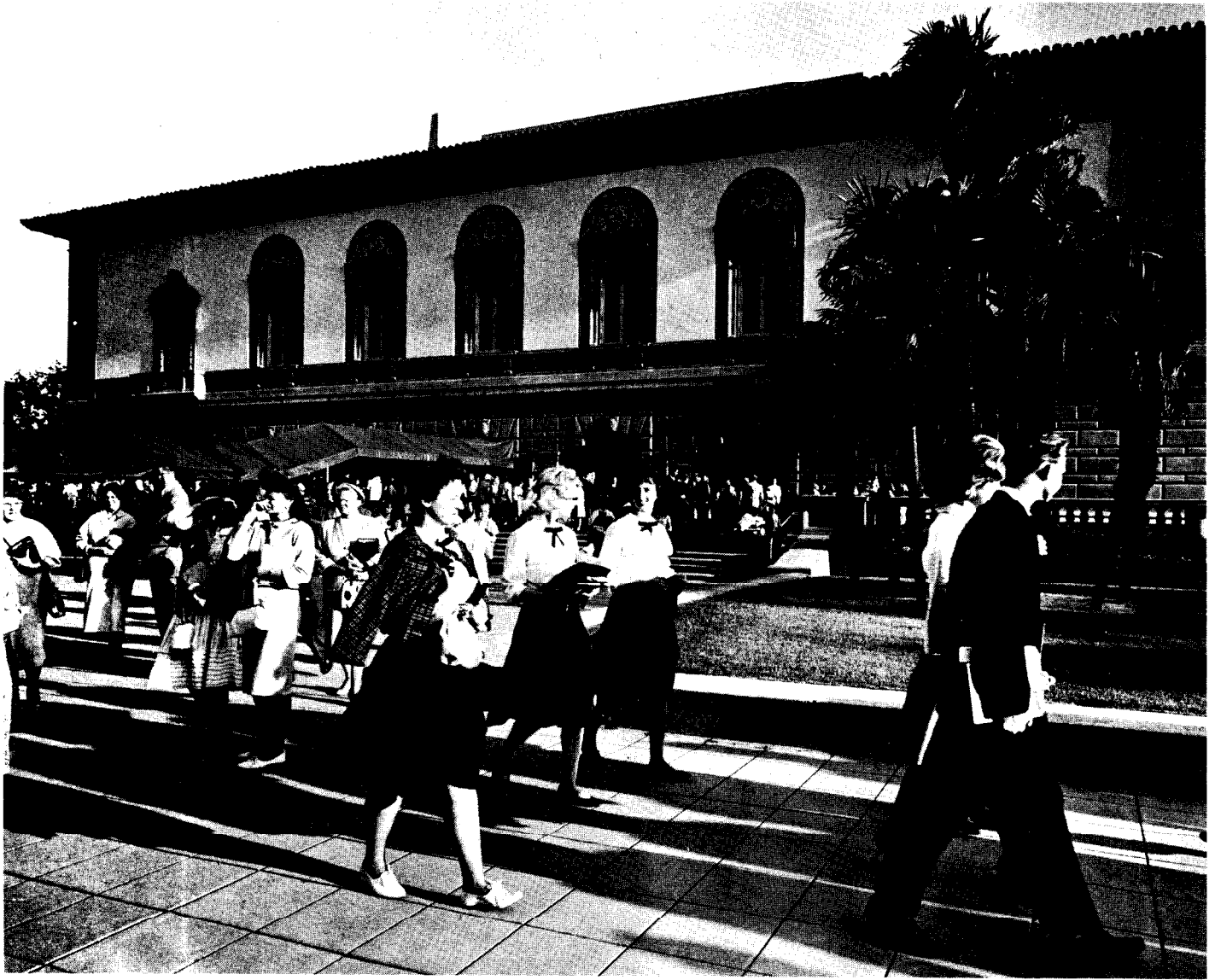
Outside view of the Civic Auditorium showing brethren and Ambassador students leaving one of the services.

brethren in attendance even on the weekly Sabbath to hear the sermons. Many had come in from Wisconsin, Minnesota, Iowa, Nebraska, Michigan, Indiana, Kentucky, and other outlying states to attend the entire Festival in Chicago.