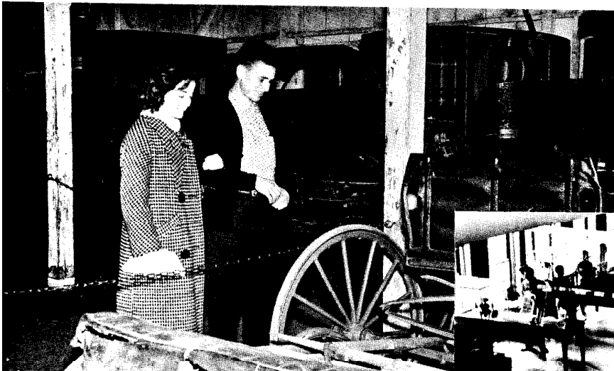
A visit to Knott's Berry Farm provides an excellent opportunity for contrasting relics of the OLD WEST with our modern day transportation.