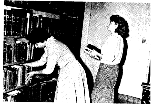
Our library science class maintains order by cataloging, repairing and shelving new and returned books.

FIVE THOUSAND copies of printed as you read these words. you a