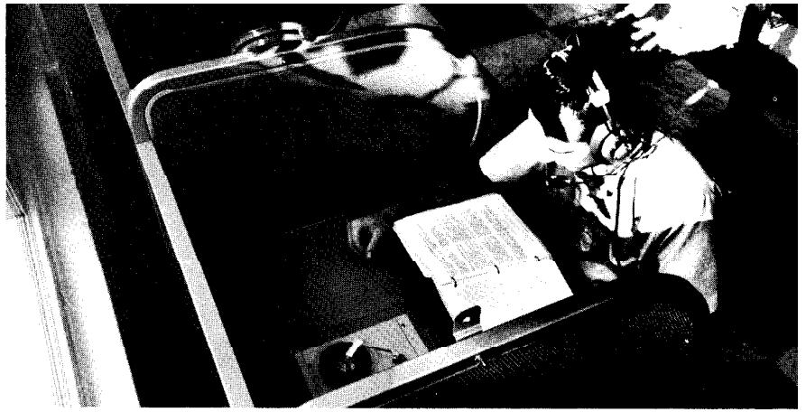
Special language laboratories, equipped with tape recordings and earphones aid in the learning of foreign languages.