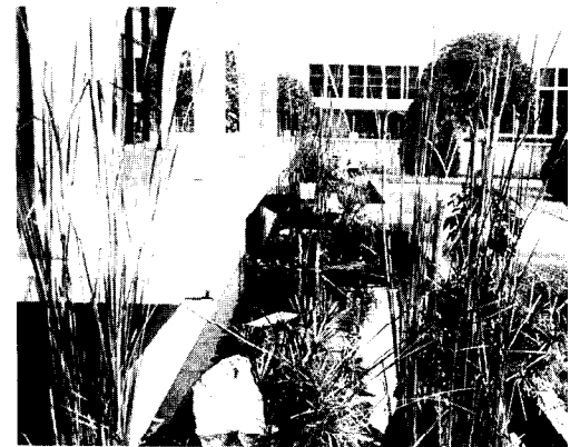
East side of CCC Building where our office entrance is located.