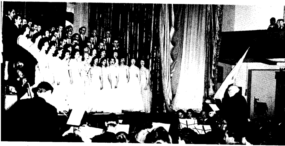
The sixty voices of the Ambassador Chorale fill the auditorium with the classic song, BATTLE HYMN OF THE REPUBLIC.