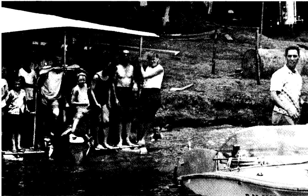
The Summer Educational Program in full swing! The children of many of God's People have the privilege to enjoy the time of their lives—as well as develop character this summer.

"At first letters of encouragement were read from the Mail Receiving Department. The people were then instructed about their responsibility of how to be a light in the community (Please continue on page 22)