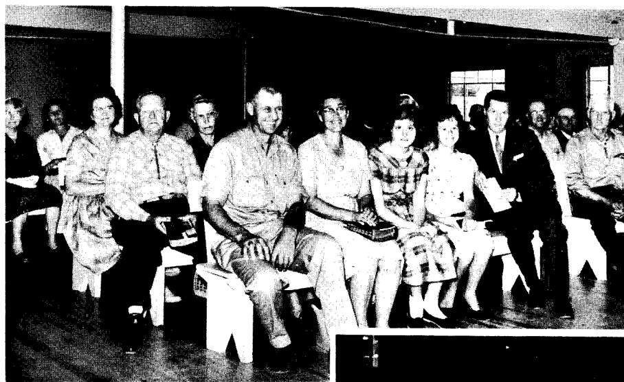
Upper Left: Newly established Bible study at Omaha, Nebraska. Center: Another Bible study recently begun at Rapid City, South Dakota. Lower Right: New church at Boise, Idaho.

"Looking back to our beginning in Kansas City two years ago we had 112