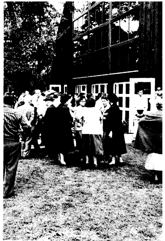
God's people relax in friendly conversation after lunch at the Tabernacle site in Big Sandy, Texas.

These problems have been solved and brought under control now. But they were brought about by the SELFISHNESS, GREED AND THOUGHTLESSNESS of God's People. Let's be sure it doesn't happen again. Be sure you are not guilty of mis-using your tithe.