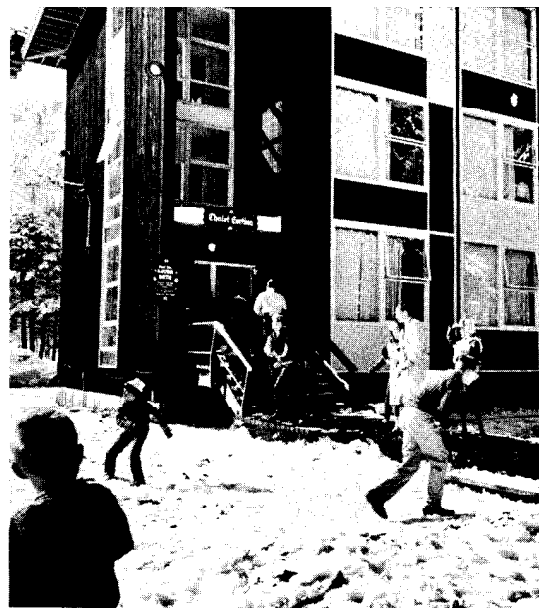
Children at play in Squaw Valley. God has provided His people with breath-taking scenery and lovely surroundings in which to enjoy His Festivals.

You need to figure the total number of miles you drive each year. Then figure what percentage of those miles