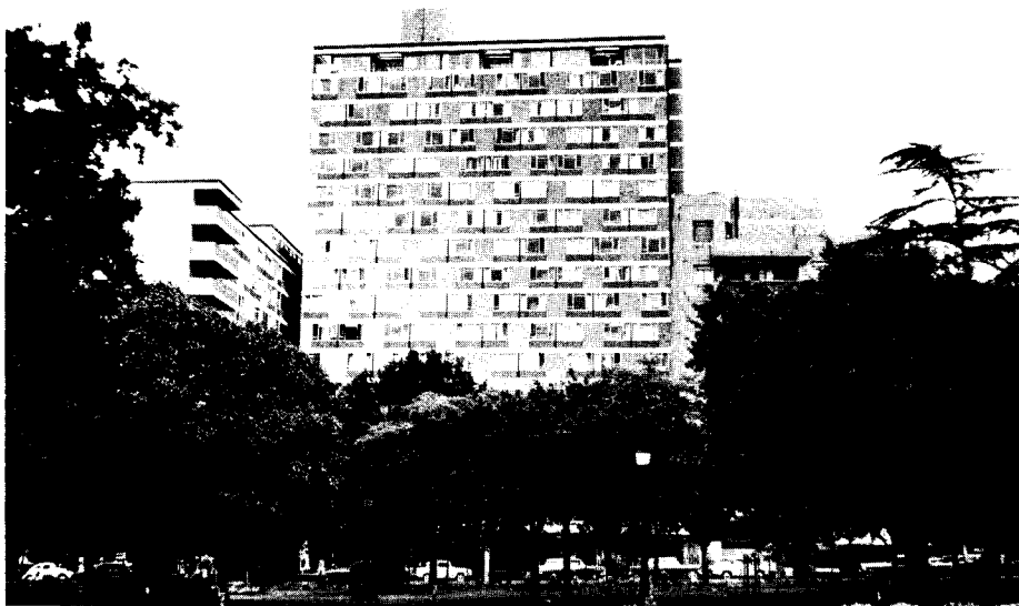
Windsor Gardens, Johannesburg, South Africa. In these 17th-floor penthouse offices, the Work of God in South Africa is carried on.