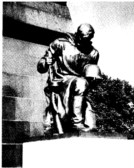
Statue at Russian War Memorial in East Berlin. Soldier kneels with machine gun in hand—praying to HIS god!

If a person is already in military service, he may not know what to do in order to receive a discharge. Such an individual needs specialized help and instruction from counselors who are