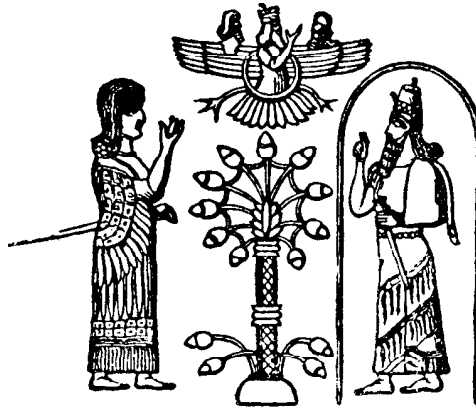
Left: Here is the trinity—worshipped centuries before Christ in Assyria. Right: Here is the trinity—worshipped by sheer pagans in Siberia. The trinity is quite UN-Christian!

But heaven is NOT the reward of the saved! God's TRUTH is that the saints shall reign on the earth (Rev. 5:10)