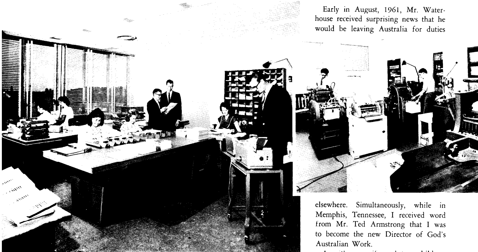
LEFT: The office staff in action! Here you see the mailing of the Correspondence Course to Australian members. RIGHT: Australian Printing Department printing the Correspondence Course.