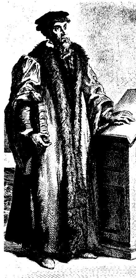
John Calvin, a leading Protestant "reformer." He assumed dictatorial powers in Geneva, Switzerland—and mercilessly persecuted other Protestants.

The Protestant persecutions have not been nearly as severe or as extensive as the Catholic's. Nevertheless, the Protestants are also guilty before God because