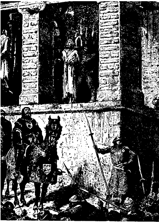
From an old woodcut a typical occurrence during Middle Ages—more victims of religious persecution.