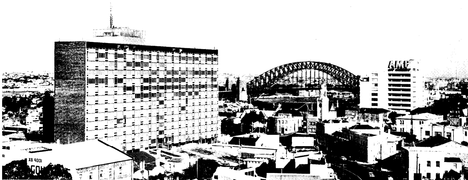
Offices of the Australian Work are located in this building.