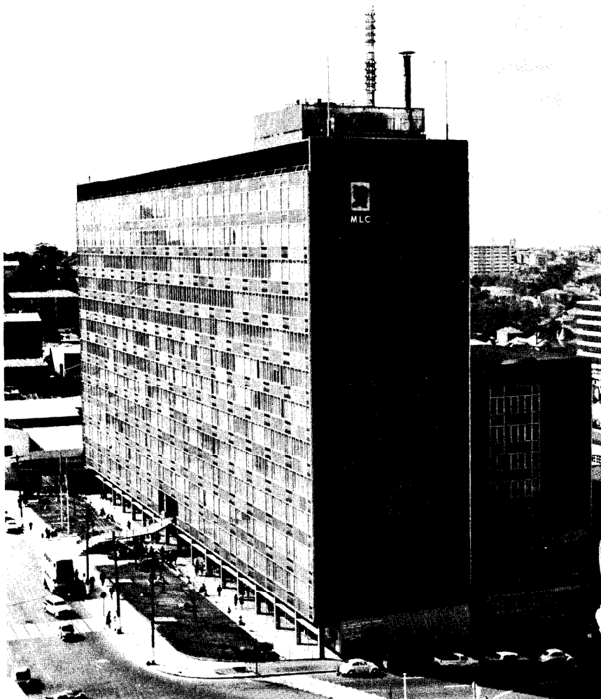
Another view of the MLC (Mutual Life and Citizens Assurance) Building. Our offices are located on the sixth floor. Actually, they are on the SEVENTH floor. Australians do not count the first floor level.