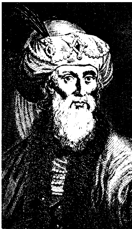
Artist's sketch of Josephus. His writing reveal which books Jews accepted as Scripture.

In short, Catholics claim that the Septuagint is the inspired version of the Old Testament—and that it contained the Apocrypha. On this "proof" rests most of the claim for the Catholic