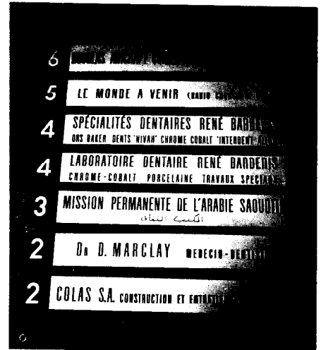
"Le Monde A Venir" is the listing for our office in Geneva.

Faced with this desperate situation, our lawyer played the last card in his