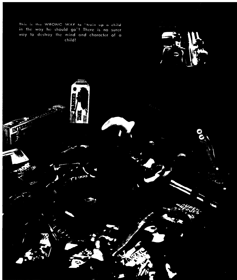
Ambassador College Photo

The person who can truly enjoy a good time better than all others is a