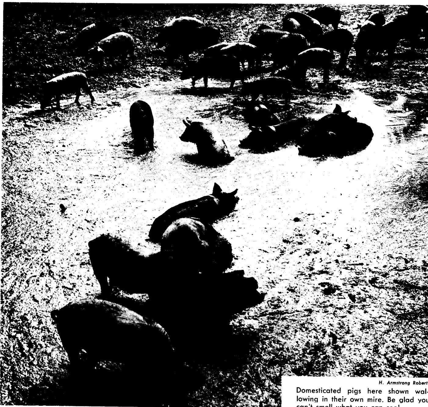
H. Armstrong Roberts

Domesticated pigs here shown wallowing in their own mire. Be glad you can't smell what you can see!