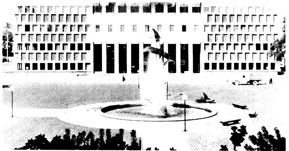
The Hall of Administration stands ready for occupation.