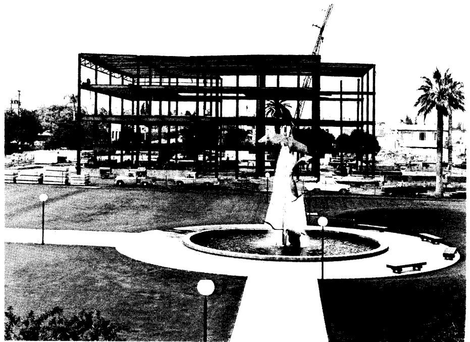
In February the steel girders were raised and in a few days the skeleton of the building began to take shape.

The top floor includes a recording studio for the World Tomorrow Pro-