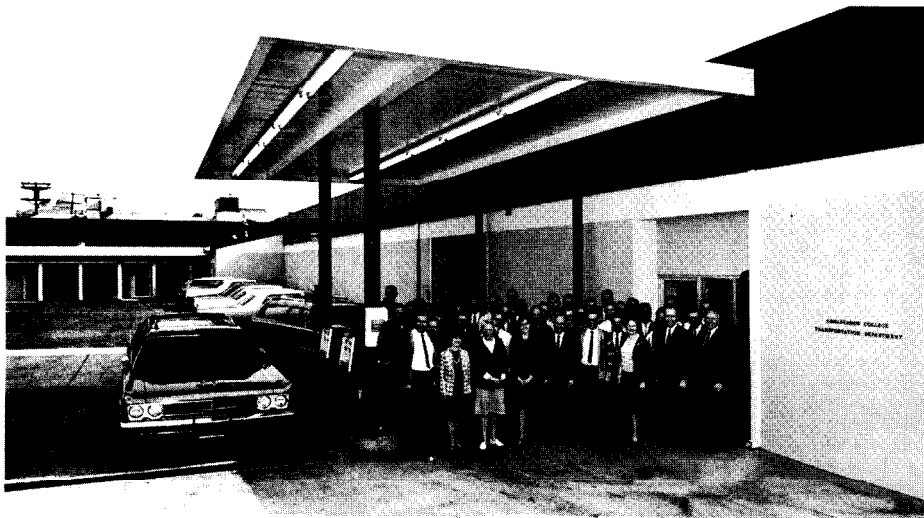
Ambassador College Photos

Shipping and Receiving is also the general receiving area for the entire campus. During 1968 over 10,500 shipments, consisting of over 37,500 packages, were received. They ranged from personal packages for students (“care packages” from home) to huge blocks of machinery. Once on campus, these packages must be delivered to the proper parties, and as the college ex-