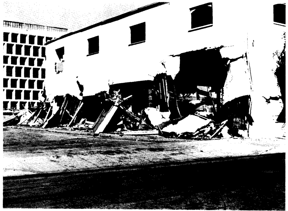
Finally the old Mailing Department bit the dust — a victim of progress.

This building is the fifth in Ambassador College's 12-million-dollar expansion program, and reflects the tone and character and cultural atmosphere that Mr. Herbert Armstrong has long stressed. It now joins the Student Center Building as part of a complex which will be completed with the planned construction of a new Auditorium as the sixth, and final, building of the present program.