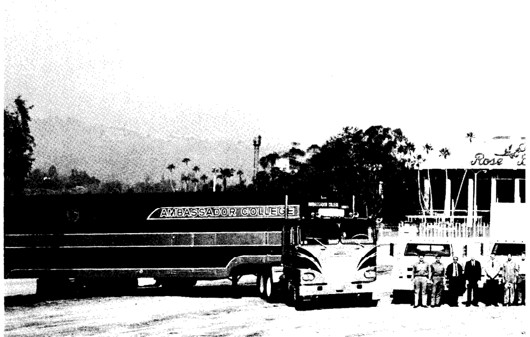
Ambassador College Photos

ABOVE: The Heavy Equipment section of Transportation in full regalia and military form lined up at attention in front of Pasadena's famous Rose Bowl.