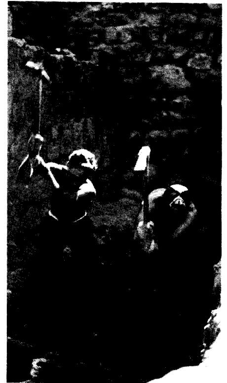
"Last year I couldn't spell ARKYOLIJIST — now I ARE ONE!"

vided right from our front door to the working area. Transportation to Jerusalem for students who wish to shop or do sight-seeing is provided by a city bus which stops about a block from our hotel. Busses stop running at eight p.m., although there are taxis available at all hours.