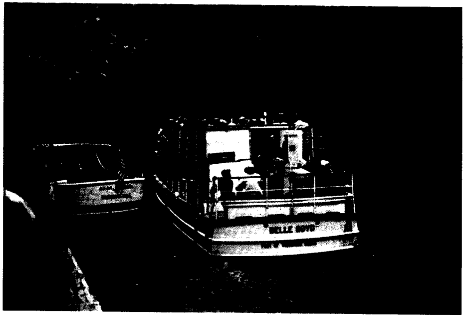
Clayton — Ambassador College