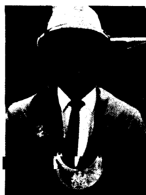
Kilburn — Ambassador College