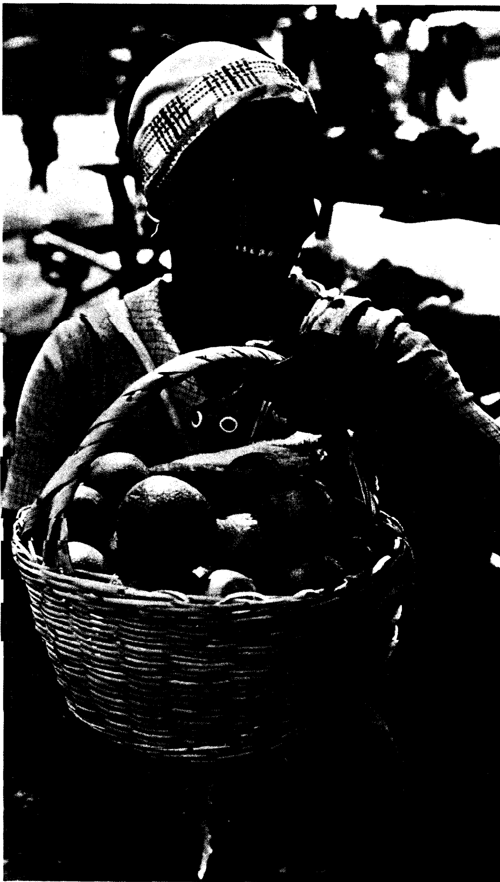
Above: Rhodesian lady cheerfully displays her market produce for photographer. Right: Proverbs and slogans are seen on vehicles and other places throughout the country of Ghana.

Villages generally are families grouped together under one leader who has formed a governing body to assist him, composed mainly of the more prosperous men. There is a communal life to which all contribute and all benefit.