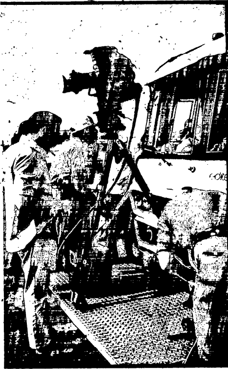
Traveling with mobile TV unit (above) enabled Mr. Armstrong to conduct on-the-spot interviews with prisoners. Two 12- to 15-hour days produced material for one Sunday and three daily programs as part of a larger series on crime. This remote, flexible, TV-recording capability allows production of videotape programs outside the studio.

brutality, homosexuality, traffic in drugs within the prisons and the like were very shocking. We found a searching for identity and a hunger for right goals and purposes in life, however plaintively stated, by those at both institutions.