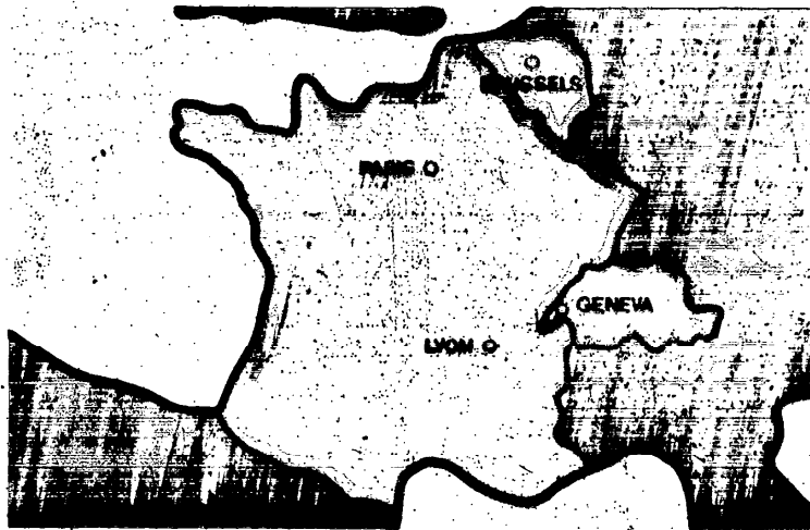
Map by Gray Smith