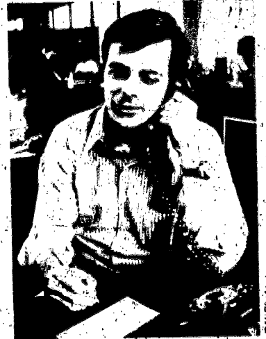
STUDENT OPERATOR answers a call on the WATS line.

thanks to even more effective promotion of literature and the WATS number on TV, the volume of phone calls broke one record after another. During the last weekend in February, a new daily record of 3750 calls, plus 3200 feet of recorded calls, was set. March set a new monthly record — 35,000 live calls alone. Because of the heavy load four new lines were added. And just in time — another record was set in April when over 59,000 telephone literature requests were processed. In August over 60,000 phone calls came in.