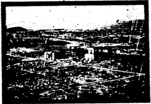
U.S. Air Force