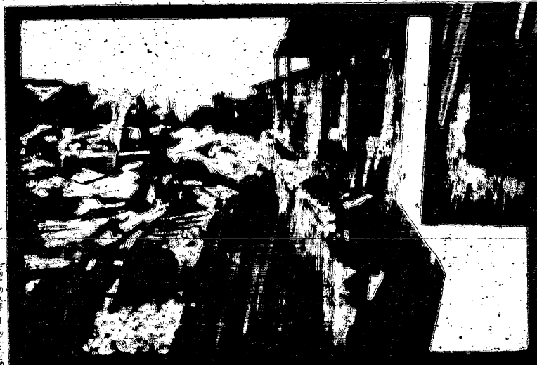
VIETNAM REVISITED: women weeps at destruction of their village, manness take cover in foxhole. Statue at United Nations Building (opposite page) bears ironic inscription in view of the arms race and nuclear event.

Unless God put a sudden stop to man's misguided activities, Christ plainly states there would be no hope for the survival of the human race.