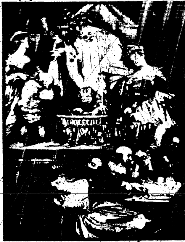
ST. NICHOLAS presides over rites of December Saturnalia rebaptized under the name of Christmas.

Furthermore, not only was the date of worship of a pagan festival