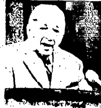
VIDEO TAPING — Herbert W. Armstrong addressing the Tucson Ariz. church June 10 in the second of a series of videotaped sermons. These sermons will later be edited for half hour telecasts on The World Tomorrow with Herbert W. Armstrong as the television program is now called.

(Continued from page 1) supreme command, UNDER CHRIST. During those 35 years the Church and the Work Grew AND Grew AND Grew. It had Christ's blessing!