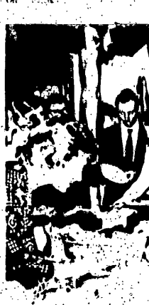
ETHNIC EVENING.—Members of the Saskatoon Sask. Women's Club and their guests sample Ukrainian borscht and cabbage rolls.

YOU Day Cleveland Ohio YOU men here held their annual YOU Day on May 13.