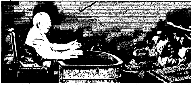
FEAST MESSAGES — Herbert W. Armstrong delivers two messages July 21 and 22 to be shown at all sites during the coming Feast of Tabernacles. The message recorded during the first part of the weekly Friday-night Bible study will be shown at opening-night services at the Feast, and his full-length sermon the next day is scheduled to be shown at services on the first Holy Day during the Feast.