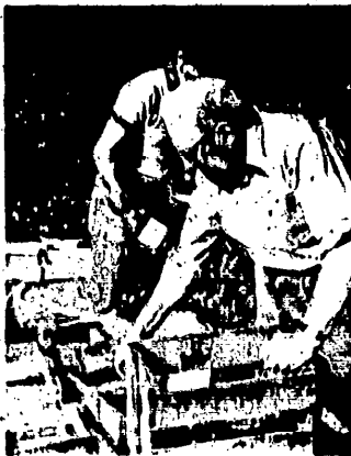
BOTTLED UP — Families of the Auckland, New Zealand, church collect and sort some of the 140,000 bottles they gathered in a $3,500 fund-raising effort June 18. The proceeds will help finance a future series of advertisements in New Zealand. (See "140,000 Bottles," this page.)