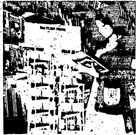
PLAIN TRUTH NEWSSTAND — A reader examines a copy of The Plain Truth at a newsstand in a bookstore. Herbert W. Armstrong (discuss as the Plain Truth and expansion of newsstand circulation in the accompanying article on this page.

This basic program was supplemented monthly co-worker letters from me, semi annual letters to all subscribers and a