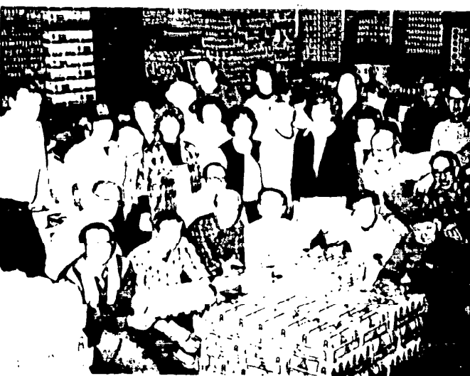
BOTTLE BRIGADE Toledo, Ohio members take time out from sorting broken beer bottles and assembling eight pack cartons. (See Church Activities, this page.)

THE BROTHERS A group of brothers met for a social gathering. The group discussed various church activities and plans for the future. The meeting was held in the church's social hall and was attended by many of the church's members. The group was led by the church's pastor and included many of the church's active members. The meeting was a very successful one and the group adjourned at a late hour.