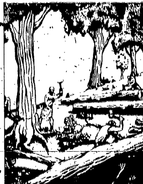
The building of Noah's massive ark required large amounts of timber.

Genesis 6:2 tells us, however, that even this righteous line of Seth eventually gave in to the corruption around them. They began to marry women outside their faith and soon