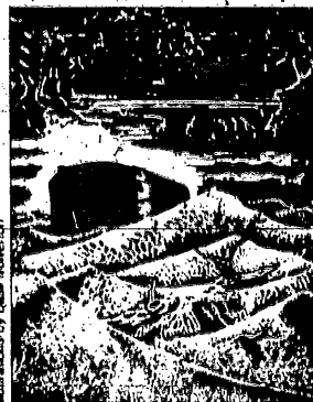
All earth's air-breathing life perished; except the ark's precious cargo.