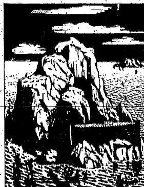
The ark ran aground on Mt. Ararat after five months on the waters.