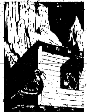
A dove Noah sent out returned with an olive branch.