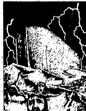
God caused it to rain for 40 days and 40 nights