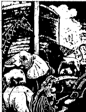
God caused the animals to come to Noah and board the ship