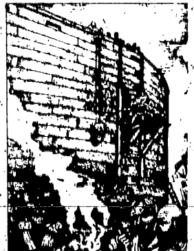
The work went on for decades — what the world refused to repent.