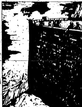
A year and 10 days after the flood began, the earth was again dry.