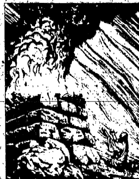
Noah offered sacrifices of thanksgiving to God.