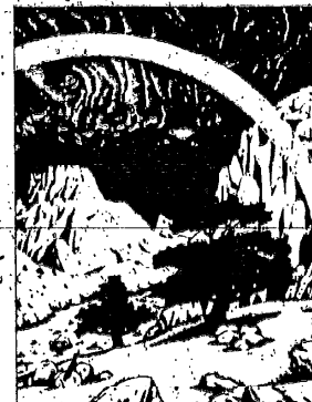
The rainbow symbolized God's promise to never again destroy all living things.