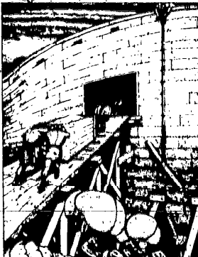
The ark was designed to hold numerous provisions also

Skeptics have claimed the ark couldn't possibly hold all those animals and provisions, but simple fact proves otherwise, for the average size of the animal kingdom is roughly that of a medium-sized dog. There was plenty of room for everything, including waste. The physical dimensions alone stagger the imagination: 450 feet long, 75 feet wide, 45 feet high. It had three decks totaling more than 2½ acres of surface, and its capacity in volume exceeded 1.5