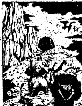
Noah's unusual passengers disembarked to repopulate the earth