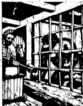
Noah had to care for his ship's great menagerie.