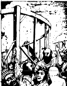
Noah suffered harassment and ridicule for making the great ship.