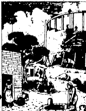
Hired craftsmen were undoubtedly necessary for the boat's construction.