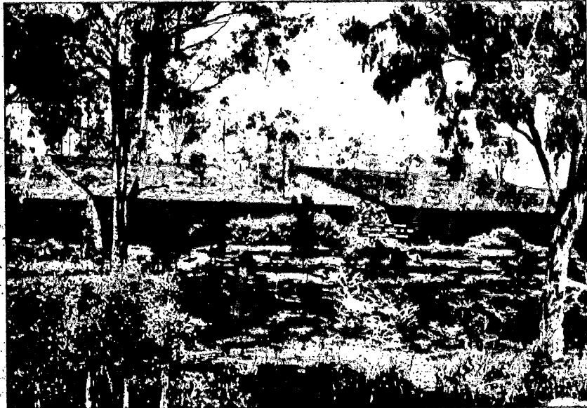
Specially designed to fill the needs of the Work, this 14,000-square-foot office building in Burleigh Heads, Australia, was completed in 1976 and now houses the regional headquarters.

Once the office was established, the Church began to