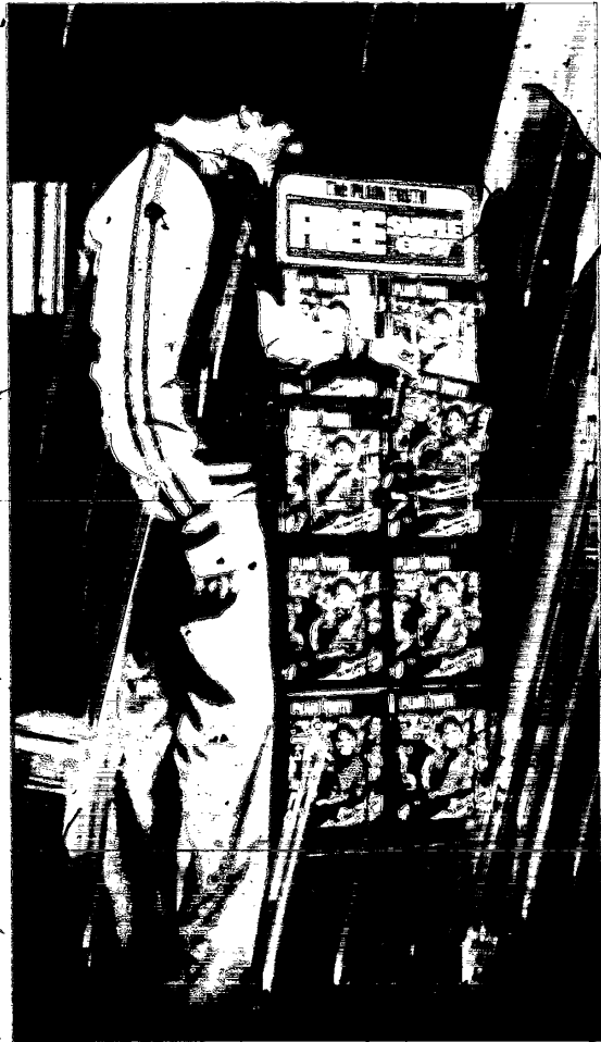
Plain Truth newsstands, which distribute millions of magazines annually, help more people come in contact with the Work's message.

More than 3,000 members across America have distributed more than half a million special 32-page newsstand Plain