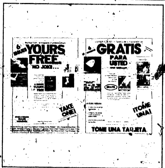
Offering the lowest cost-per-response of any of the circulation promotions, PT cardholders are used in the United States and Latin America.

While expanding the newsstand program among the Spanish-speaking population in the United States, a new concept for gaining subscribers to La Pura Verdad (the Spanish Plain Truth) was developed. An attractive, inexpensive holder filled with subscription cards was tested at various locations, and the results were rewarding. By-passing government censors, red tape and other problems, the cardholders were sent to