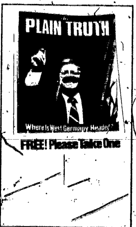
A counter-top display offers a free Plain Truth.

Thousands of other people have become co-workers, enrolled in the Ambassador Col-