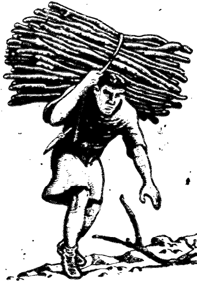
The man who gathered sticks on the Sabbath paid with his life for not respecting God's holy time!

the puzzled people that they asked one another. "What is it?" Manna (meaning, "What is it?") derived its name from this question. Thereafter it was called manna from heaven . Israel lived on this and quail for the remaining years of their sojourn, while isolated from all worldly influence.