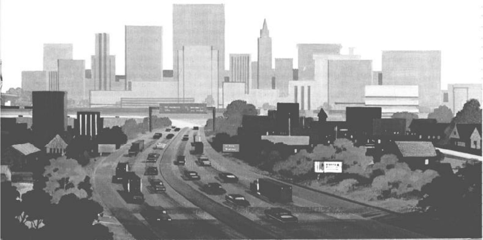
Illustration by Ken Tonell

The next command forbids adultery. Many people want to do away with this command today. But Jesus showed that it is more encompassing now than before the New Testament period. He also emphasized its importance and the spiritual application of this law today when He said that it is wrong now even to lust: "But I say to you that whoever looks at a woman to lust for her has already committed adultery with