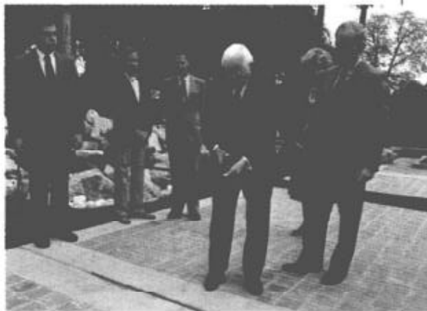
Ongoing achievement: Herbert W. Armstrong opens new mall area on Pasadena, Calif., campus of Ambassador College.

On this assignment I pioneered in making surveys, based on the law-of-average principle, sampling public opinion, attitudes, consumer buying habits, facts about life — about failure and success — about mental states of