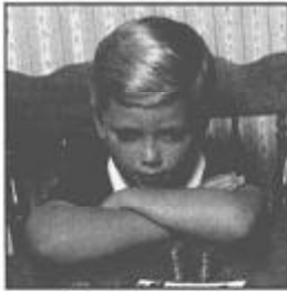
Teaching Children About Money See page 19