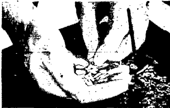
Plant Good Seeds! See page 25