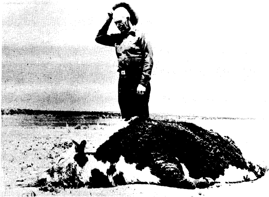
Cattle die in the worst drought to hit the Southwest in 50 years.

allotted for His work. God allotted a similar period of two 19-year cycles to the prophet Jeremiah during the fall of Judah. He allotted again two 19-year cycles, beginning in 31 A.D., to the inspired apostolic New Testament Church before that Church had to flee Jerusalem in 69 A.D.