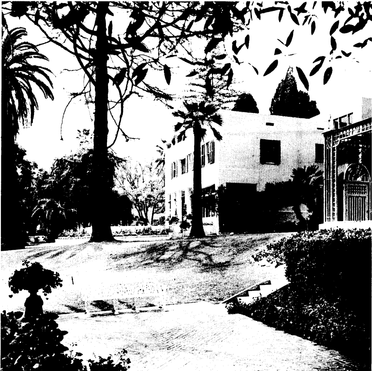
One of four patios on our picturesque AMBASSADOR COLLEGE campus