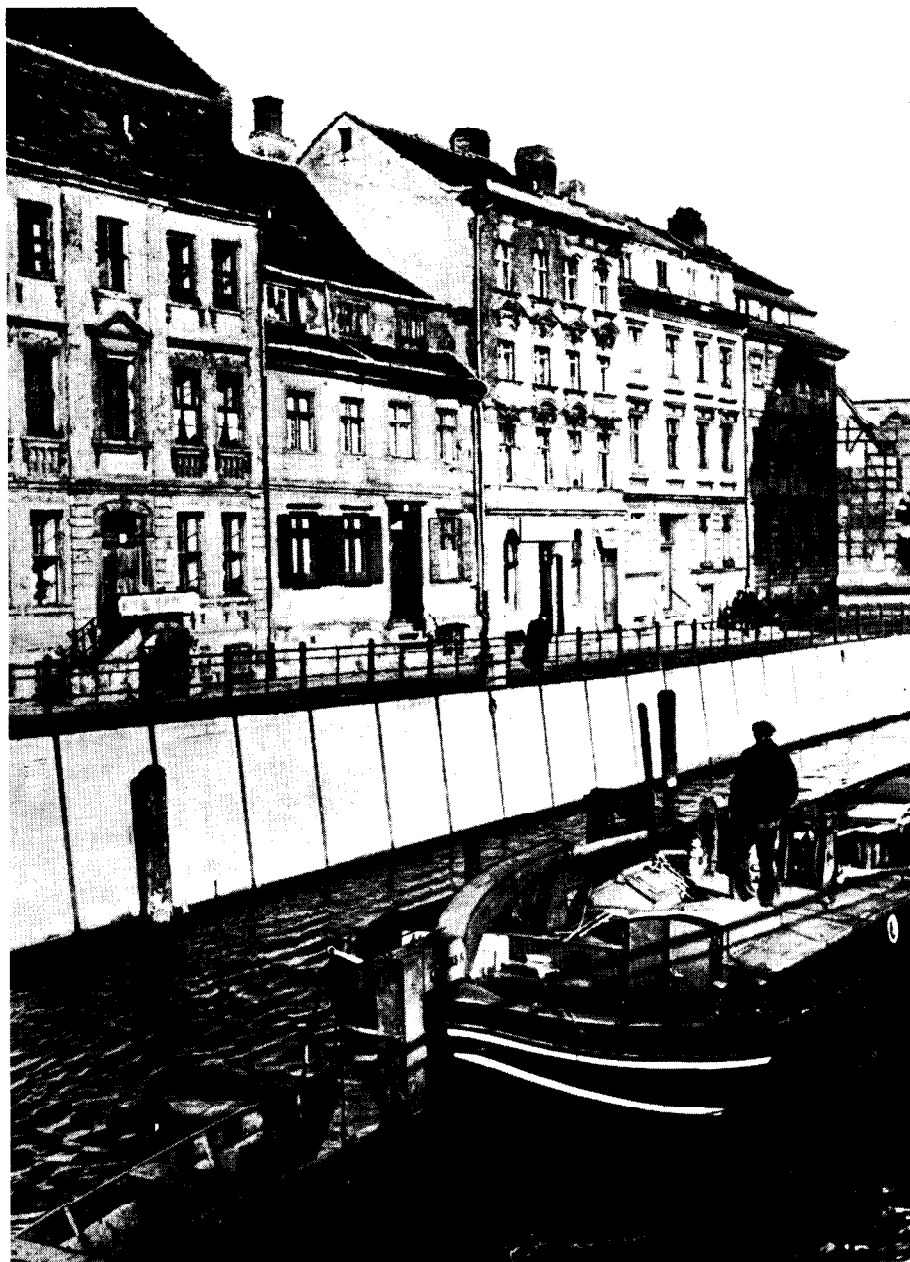
Amid political rumblings, East-Berliners remain quiet, go about their daily chores, and hope for the day when their land can once again be joined to a powerful, revitalized New Germany!