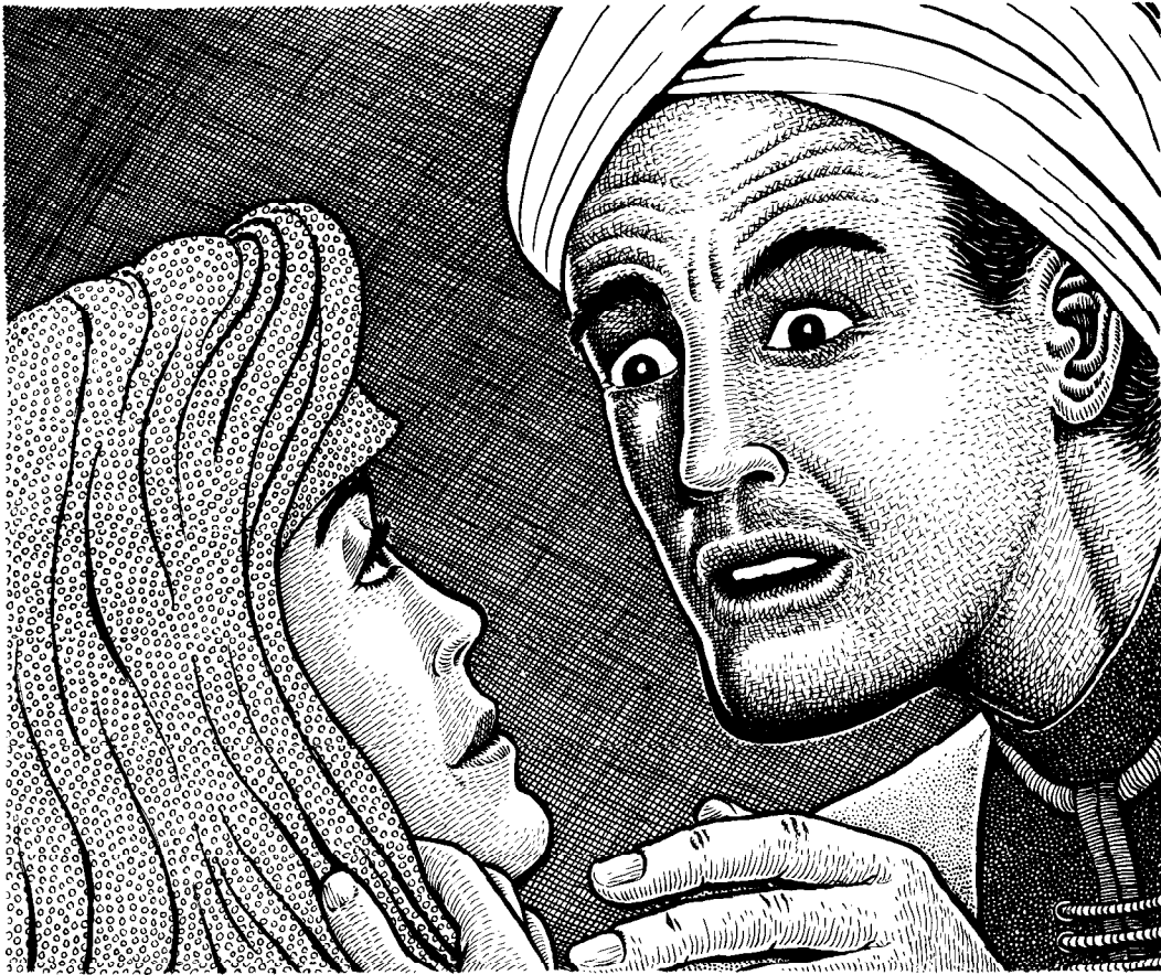
The bride drew back her heavy veil, and Jacob was amazed to see that he had married Leah—not Rachel!

When the seven years had passed, Jacob reminded Laban that it was time for the marriage. Laban gave a great marriage feast that lasted a whole week. Many people were invited, and it was a time of much celebration.