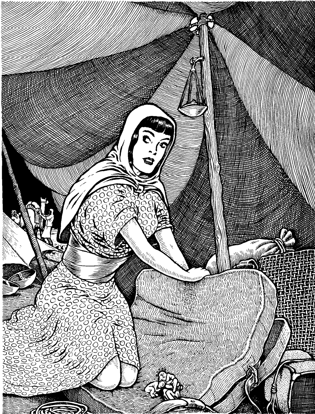
Rachel went to her tent and hid her father's little idols under a camel saddle.

tomorrow morning we'll overtake them. Then Jacob will learn that he was most unwise to leave as he did!"