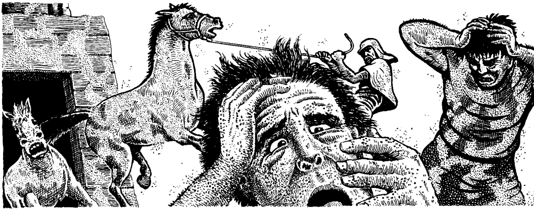
People and animals moaned in agony as their bodies became matted with the stinging insects.

Perhaps the magicians had performed their former amazing tricks through clever, natural means. Perhaps they had been helped by evil spirits. Or possibly there was a combination of both. Whatever the means, it didn't seem to be with them as they stood in fearful embarrassment before the king. The head magician suddenly bowed low, and it was plain that he was trembling.