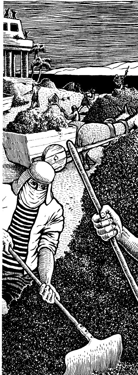
The Egyptians were still working hard to clean up the heaps of dead frogs when Moses warned of a Third Plague to come.

"Do something!" he commanded. "Prove again that our gods can produce miracles!"