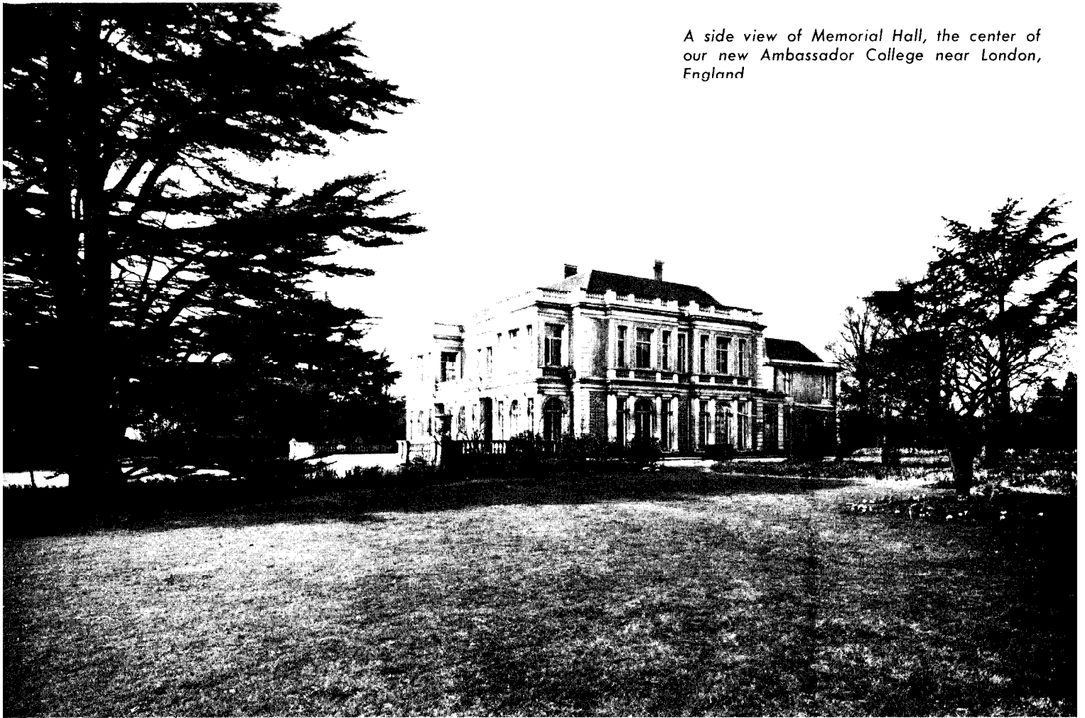
A side view of Memorial Hall, the center of our new Ambassador College near London, England