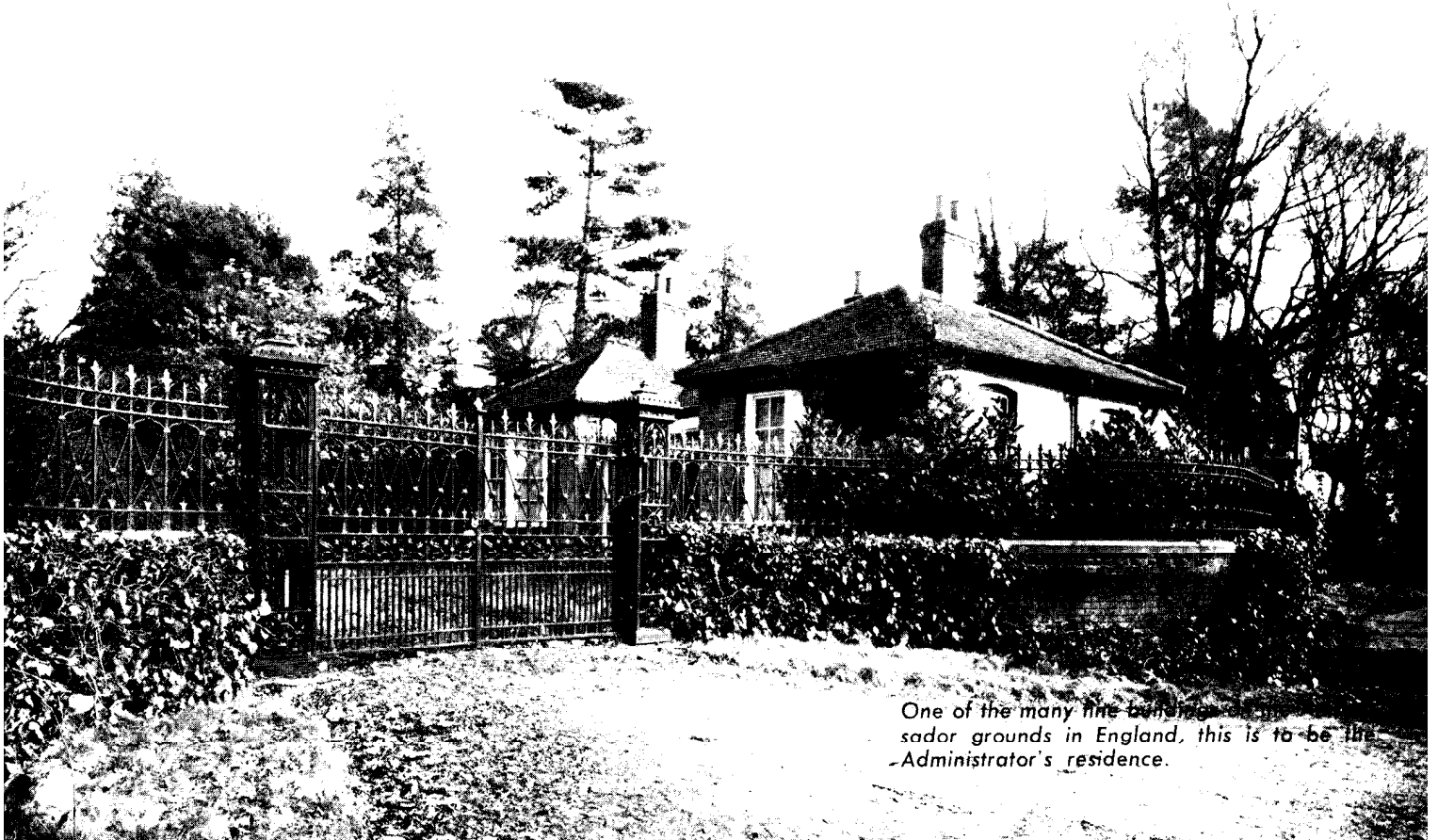
One of the many fine buildings on Ambassador grounds in England, this is to be the Administrator's residence.