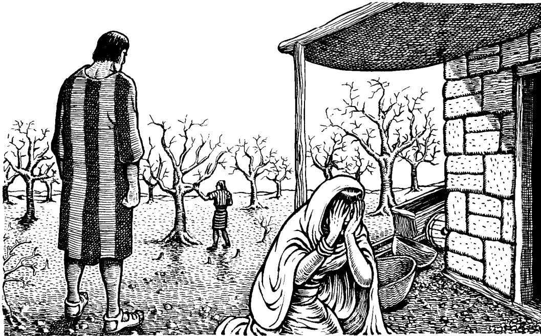
The Egyptians found that the locusts had eaten every green leaf and plant.