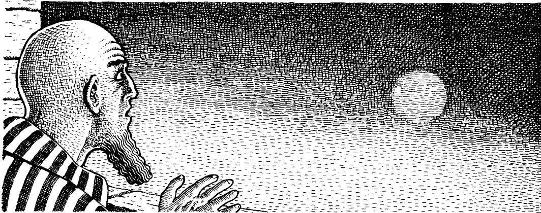
As Pharaoh gazed eastward, he saw the morning sun gradually disappear in a strange, dark cloud.