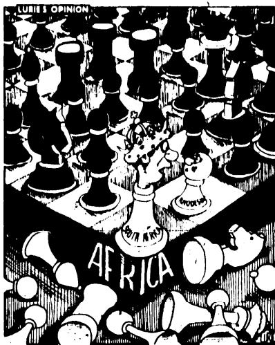
"PLAN WHAT STRATEGY?"

Coupled with the problems of widespread poverty, illiteracy, economic mismanagement, and inept leadership, the seemingly unresolvable problem of deep-seated tribal rivalries would appear to render future prospects for the continent little more promising than the dismal record of the past. □