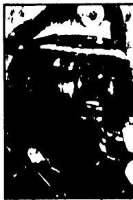
BRIGADIER GENERAL Murtala Muhammed addresses Nigerians following coup.

The incoming "soldier rulers" have generally justified their takeovers on grounds of corruption, political repression or eco-