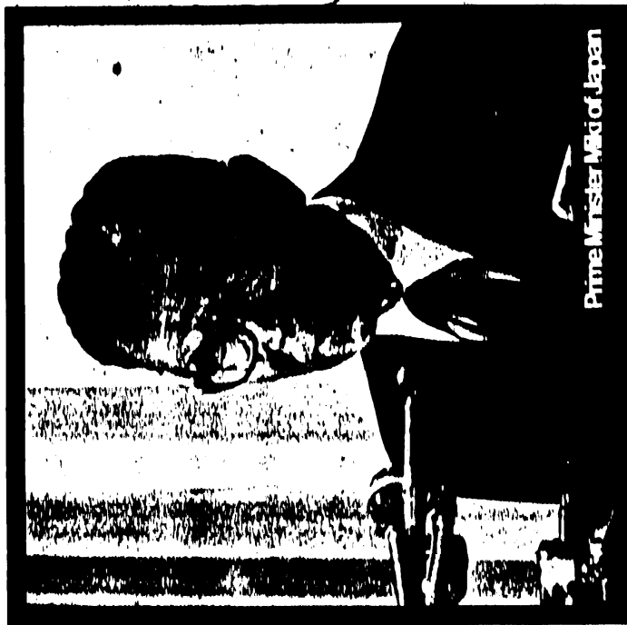
Prime Minister Miki of Japan