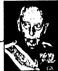
RARE candid closeup of Spain's ailing General Francisco Franco

Spanish labor unions are now completely controlled by workers' commissions. Recent union elections produced sweeping victories for left wing elements, a stunning defeat for Spain's labor establishment.