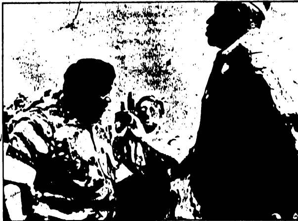
PRESIDENT IDI AMIN of Uganda admires recently unveiled statue of himself in Kampala.

Africa - the Dark Continent is showing few signs of emerging into the light. Plagued by political instability, poverty, illiteracy, inept and corrupt leaders, economic chaos, civil wars, and tribal rivalries, the nations of Black Africa, for the most part, are seemingly headed for economic and political oblivion.