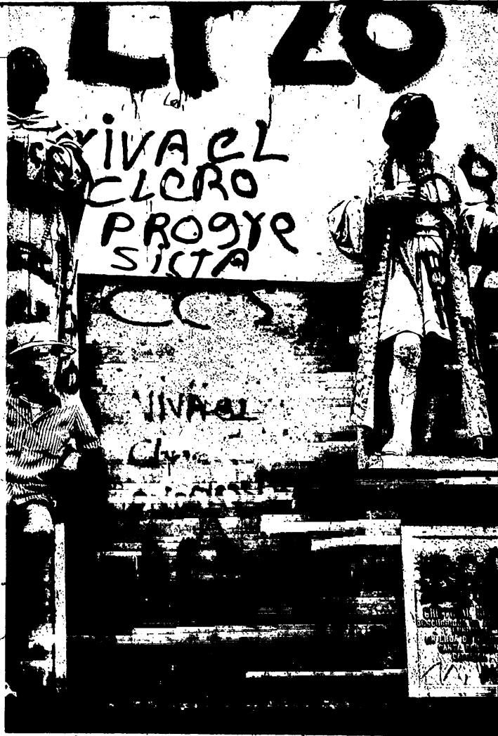
STATUE OF CHRISTOPHER COLUMBUS , right, in front of El Salvador church is besmirched by revolutionary graffiti. Slogan says "Long Live the Progressive Clergy." Priests have been in forefront of demands for radical change in Latin America.

country to be used as a staging area for Sandinista forces as well as being a major trafficker of arms for their cause.