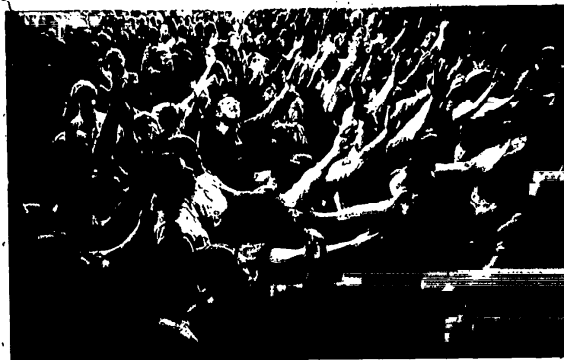
WITNESS AND TESTIMONY. In public displays of worship, many sincere people strive to draw closer to their God. Is this evidence of being "born-again"? Read this article to find out.

For some time now, large numbers of people have been rejecting the image of traditional Christianity. They see a world filled