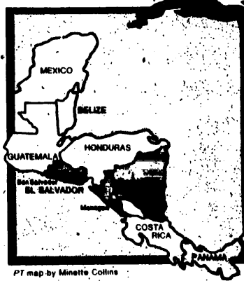
PT map by Minette Collins

sumed at first to encourage "moderates" within the Sandinista-dominated junta—has been stopped. This only permits the government to blame Washington for the economic mess. America is the "bad boy" once more.